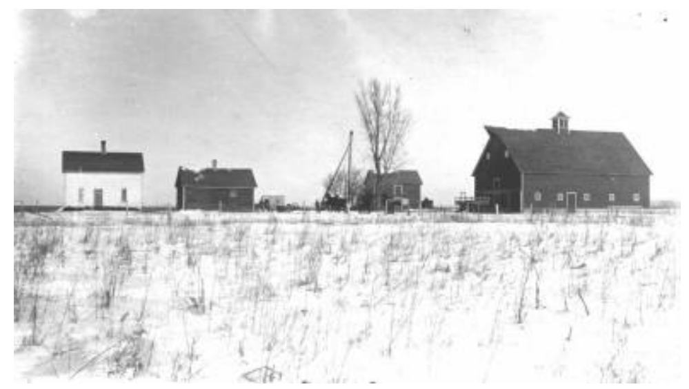
Farm near Fulda

My father was a very ingenious person. He had fixed a tank inside the pump house right next to the well. All the water the faithful windmill pumped was first used to cool our milk and the cream that we were keeping sweet so it would bring a higher price when we brought it to town to the creamery. From this cooling tank the water flowed through a long pipe to the stock tank where the herd of black and white Holstein cattle and the horses came to quench their thirst.