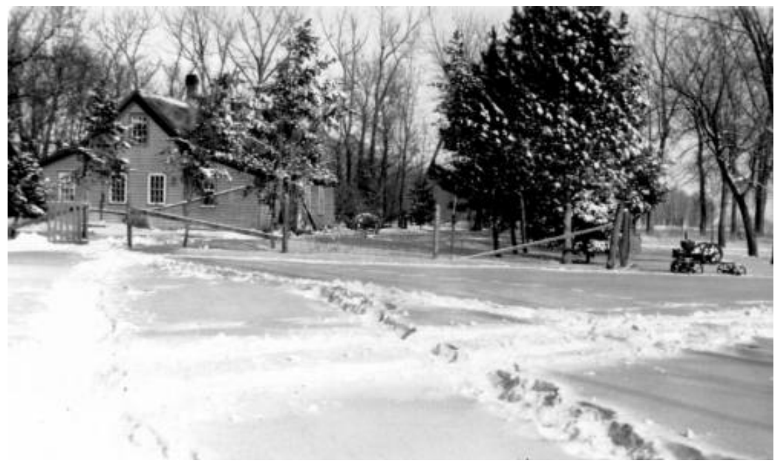
Farm north of Montevideo, 1920

We had only a little way left, but I couldn't help but think about how nice it was in the Peterson house. By now the girls would be standing beside the big hard coal heater with the glass windows all around watching the fire burn. Their home had a